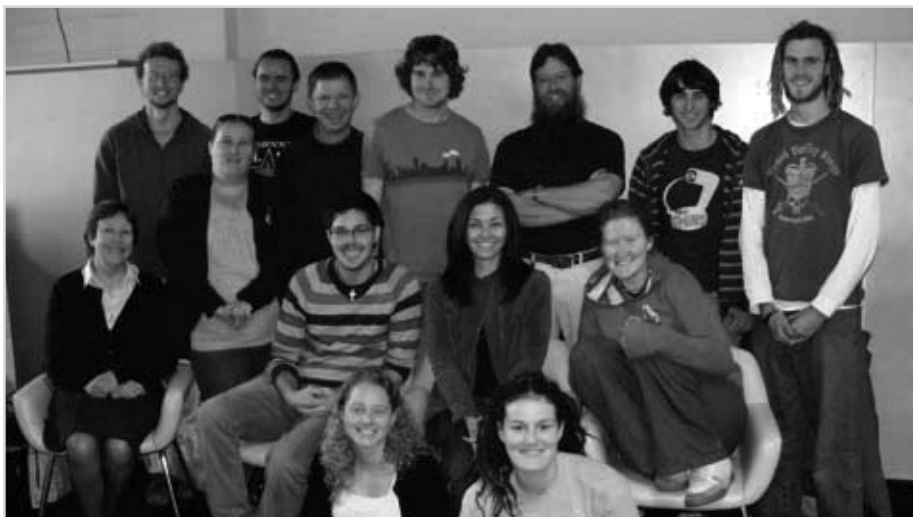
The 2008 Ngage Crew