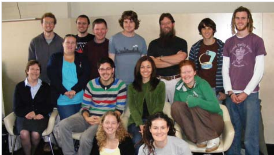
The 2008 Ngage Crew