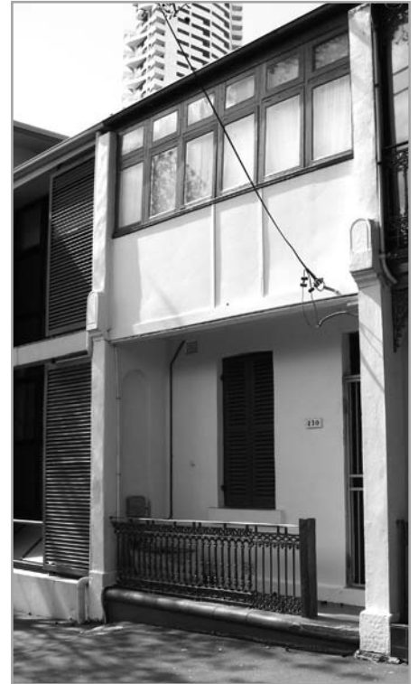
Rawson House in Bourke Street for which HopeStreet is seeking another owner or owners who can continue to support the vision of residential communities.