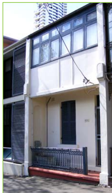
Rawson House in Bourke Street for which HopeStreet is seeking another owner or owners who can continue to support the vision of residential communities.